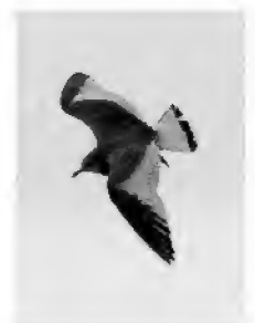
Photo of Sabine's Gull on October 1, 2006.